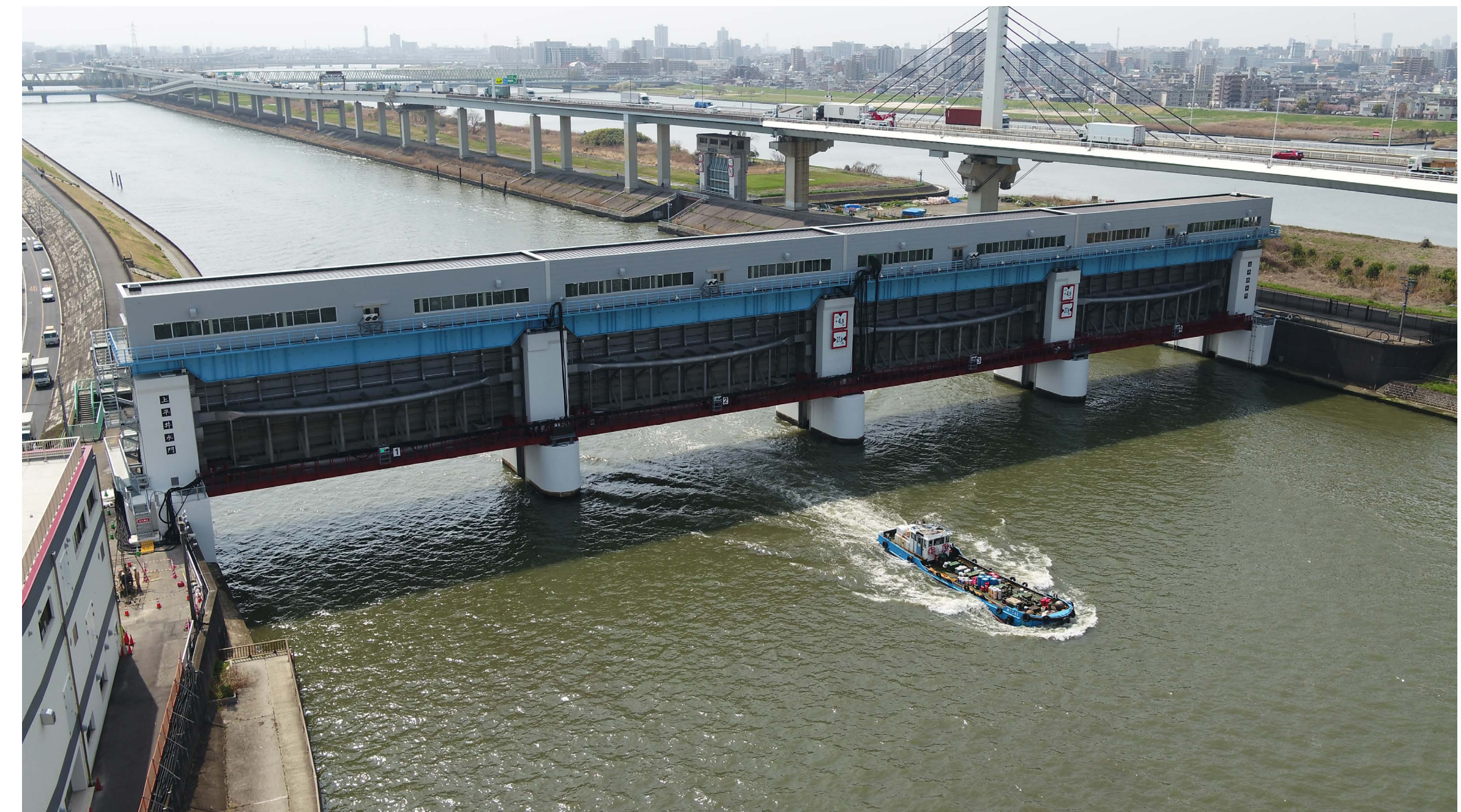
Kamihirai Flood Gate (Full view of flood gate(from upper stream side))

1. It is worthy of praise that the Kamihirai Floodgate has been renewed for five years without losing its function as