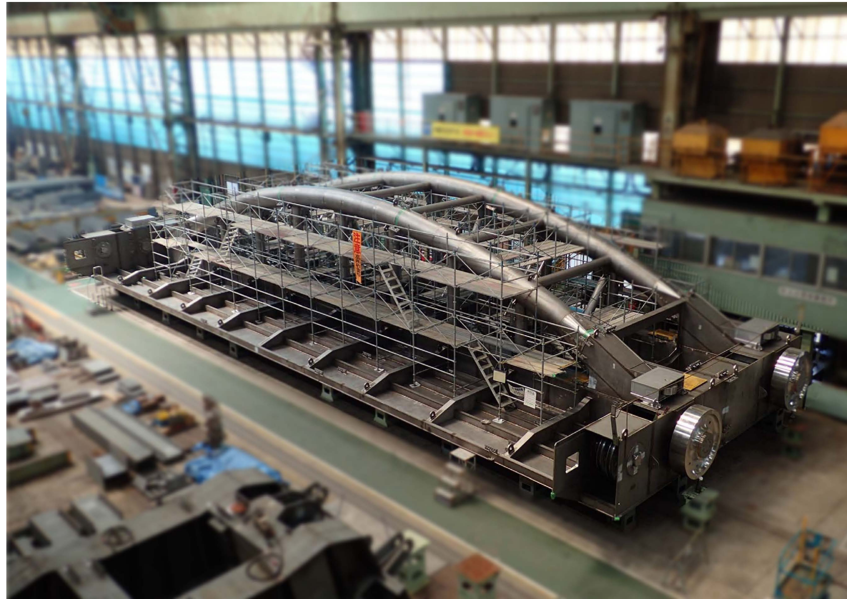
Kamihirai Flood Gate (Temporary assembly at fabrication plant)

not allowed. In addition, the stainless steel used for the gate leaf needed to be of high strength to comply with the latest stringent seismic standards